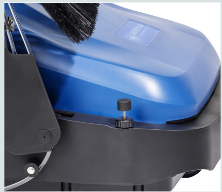
Both the main broom and the side brooms can be adjusted without using tools