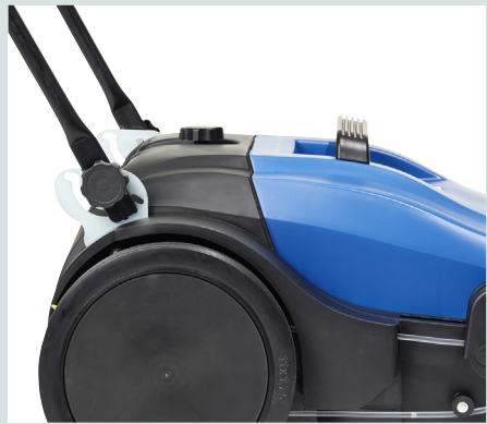
The handle can be adjusted to fit the operator height (3 positions)