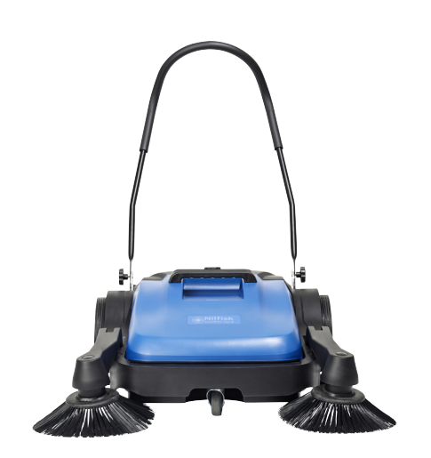
FLOORTEC 570 M with one side broom – and FLOORTEC 592 M with two side brooms – cover working widths of 70 cm and 92 cm