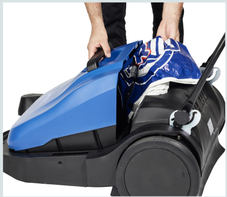
The hopper can stay in open position so it is easy to throw big items or empty a garbage bin into the hopper